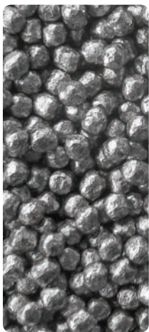
Stainless Steel - Conditioned

Made from stainless steel, carbon steel, pure zinc, aluminum, copper, and nickel wire, our product can be purchased as-cut (cylindrical with sharp edges) or conditioned (rounded to a sphere). Cut Wire Shot is the media of choice for peening, cleaning, tumbling, and vibratory finishing. It is widely used in wheel blast equipment.