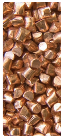
Copper - As-Cut