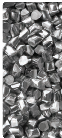
Aluminum - As-Cut