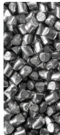
Zinc - As-Cut