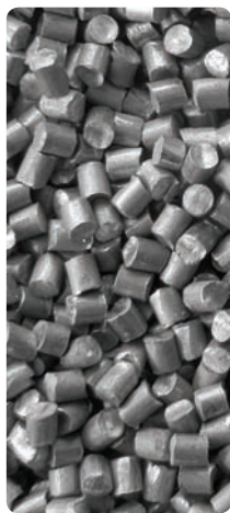
Carbon Steel - As-Cut